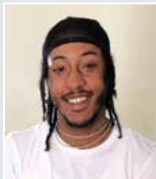
Maleel Wilson Construction Staff